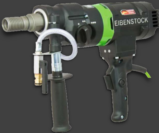
Eibenstock PLD182 - $1,995.00 3-speed wet core drill

Compact hand held 3-speed core drill for wet drilling up to 182mm. Features electronic soft start, temperature control, overload protection and mechanical safety clutch. 1 1/4" UNC male core drill bit connection. Oil bath gearbox with unique oil pump for lubrication when drilling at all angles. Bubble levels built into machine for precise drilling.