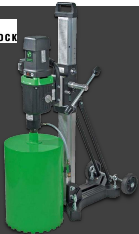
Eibenstock DBE352 - $4,755.00 Core drilling unit

Powerful unit for wet drilling from 42mm to 352mm. Features 3-speed core drill with electronic soft start, temperature control, overload protection and mechanical safety clutch. Included rig features integrated spirit level, tilts to 45 degrees and compact combination base with removable wheel axle. Barrel not included.