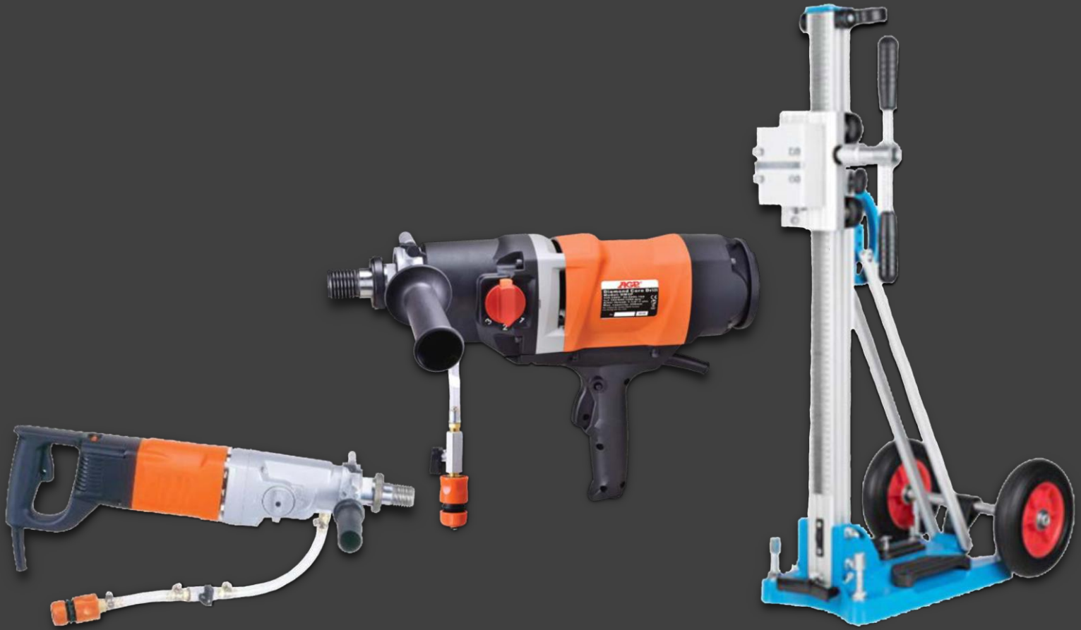
ADM160 - NLA 3-speed wet/dry core drill

Heavy-duty core drill suitable for wet or dry drilling up to 80mm handheld or 160mm rig mounted. Features 3-speed gearbox, quick release hose connection for wet drilling, slip clutch and electronic overload protection. Inline RCD for safety.