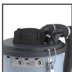
Jet pulse filter cleaning