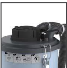
Jet pulse filter cleaning