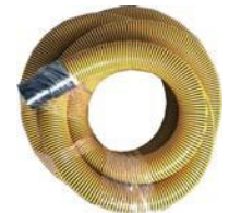
D50 EVA hose, 7.5m