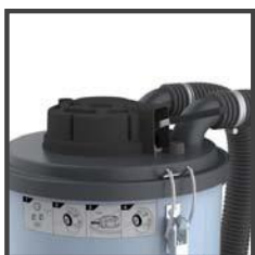
Jet pulse filter cleaning